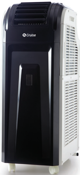
Model CRP-H12AS | Available in 1.0 TR