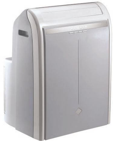
Model CRGP | Available in 1.0 TR