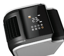
LED touch panel display