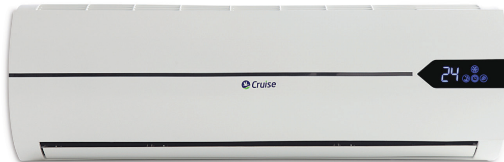
Model CRA Available from 1.0 to 2.5 TR Cooling Capacity